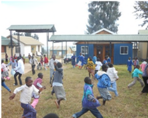
Figure 8. Teens play at a satellite Teen Club in Mafinga, Tanzania

our outreach facilities in both the Lake Zone and Southern Highland Regions. Satellite teen clubs have been initiated in Mufindi, Njombe, Iringa, Mbozi and Mbarali through UNICEF programs. They have continued to successfully host a Satellite Teen Club each month.