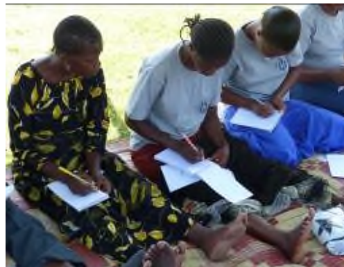
5: Caregivers taking notes while learning about TB

Finally, a member of the counseling team leads the caregivers in a roundtable discussion allowing them to share stories as necessary.