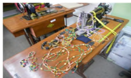
Figure 10. Products made by Bead4Bead, an IGP at Baylor-Mbeya

With the increase of adolescents attending our monthly Teen Club program, we have also worked to expand adolescent support groups to