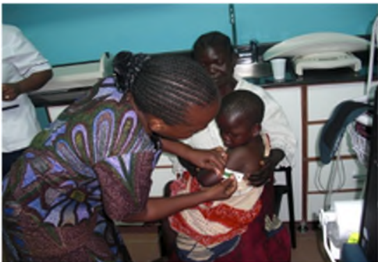
Figure 13. Nurse performing measuring exercises during a clinical attachment rotation

Additionally, both centers host clinical attachments for clinicians and nurses who are from health facilities that are beyond our reach. Clinical attachments are usually 2-week clinical rotations that involve didactic and practical sections.