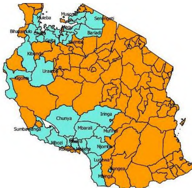
Figure 1: Baylor Tanzania Coverage Lake and Southern Highlands Zones

We are a patient-centered, pediatric HIV prevention, care and treatment program with the goal of contributing to the reduction of HIV/ AIDS-related morbidity and mortality among infants, children and adolescents in Tanzania . In addition, Baylor Tanzania provides comprehensive care and treatment for pediatric tuberculosis, malnutrition, cancer and other complicated or chronic pediatric conditions. Through direct service delivery and clinical attachment training at our two Children's Centers of Excellence (COEs) in Mbeya and Mwanza, as well as health professional training and mentorship provided at respective outreach facilities in the Lake and Southern Highland Zones, Baylor-Tanzania currently directly cares for more than 4485 children at the COEs, and thousands more at outreach sites around the Lake and Southern Highlands Zones.