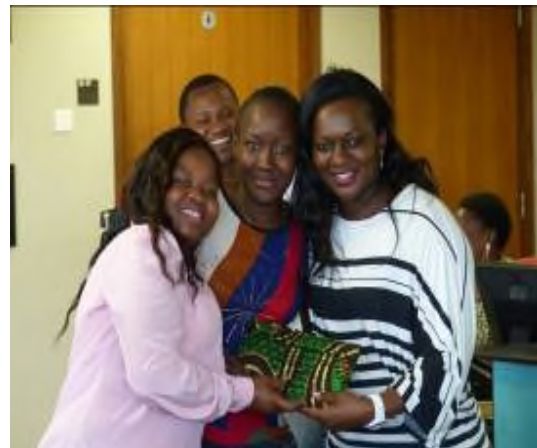
Figure 4: eens present a gift to a Teen Club guest speaker from NMB bank

As more teens attend Teen Club it is increasingly important to convey