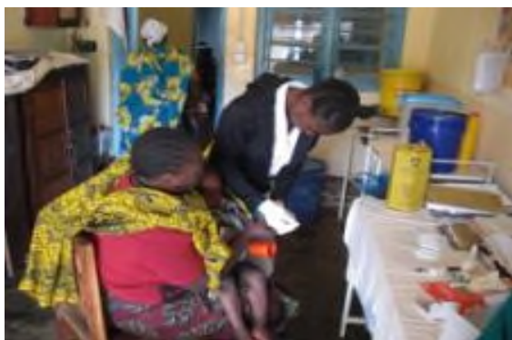
Figure II: A Nurse performing HIV Test at one of the Outreach Site

This pediatric HIV case finding approach targets testing of children of known HIV positive adults (e.g. Care and Treatment Clinic (CTC) adult clients or other high-risk, adult populations) through scheduling specific days for these adults to bring their children for evaluation and HIV testing. During the year 2013/14 Baylor has performed a number of testing events where a total of 3038 SHZ COE and 5478 LZ COE clients were tested and counseled.