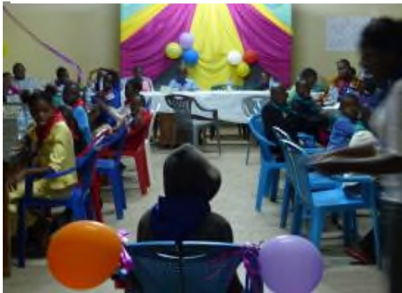
7: A camper receives a prize after being especially kind to a peer at Camp Matumaini

campers were educated about adherence in a new way. Studies to prove the suspected benefits of this DOT on camper adherence post-camp are already underway.