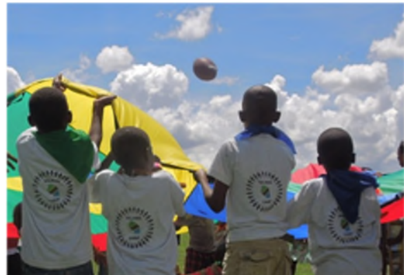
Figure 6. Campers play at Camp Salama Camp in Mbeya

In December 2012 SHZ Baylor-Tanzania launched its first ever Camp Salama. With the help of SeriousFun Network, Baylor was able to give 40 HIV positive adolescents a week of fun filled camp. Salama Camp was located off site where the adolescents slept together in cabins, ate together, played together, and of course learned together with the support of 24 volunteers. The adolescents created a peer-support network where they were able to share their life stories and were able to discuss openly about their disease. The adolescents spent five days and four nights on site learning about HIV, adherence, and creating a more healthy life. SHZ Baylor successfully hosted Salama Camp again in June 2014, this time hosting two sessions over a two week period for 80 adolescents.