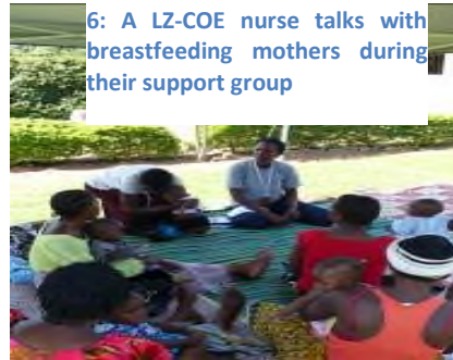
6: A LZ-COE nurse talks with breastfeeding mothers during their support group

So far the program has graduated 28 HIV+ mothers whose children are HIV-. There are 39 mothers currently attending sessions.